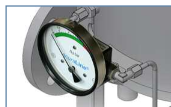
Differential pressure gauge mounted